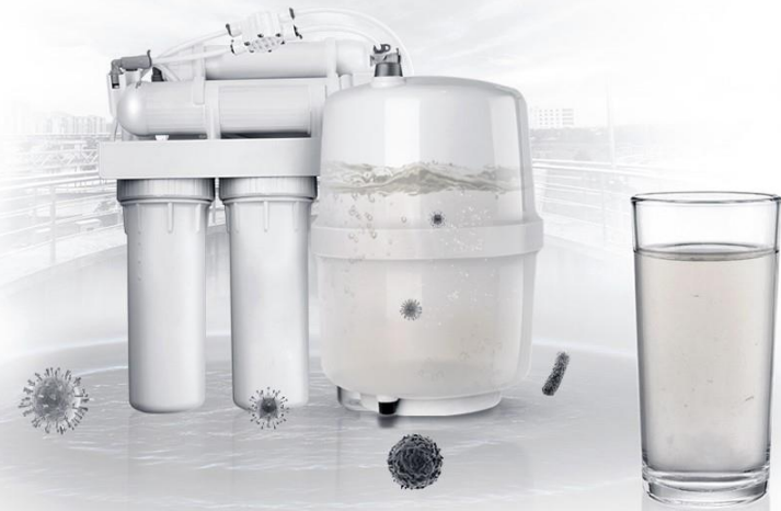
Traditional RO water purifier with water tank